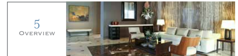
TABLE OF CONTENTS: _____