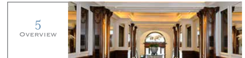
TABLE OF CONTENTS: _____